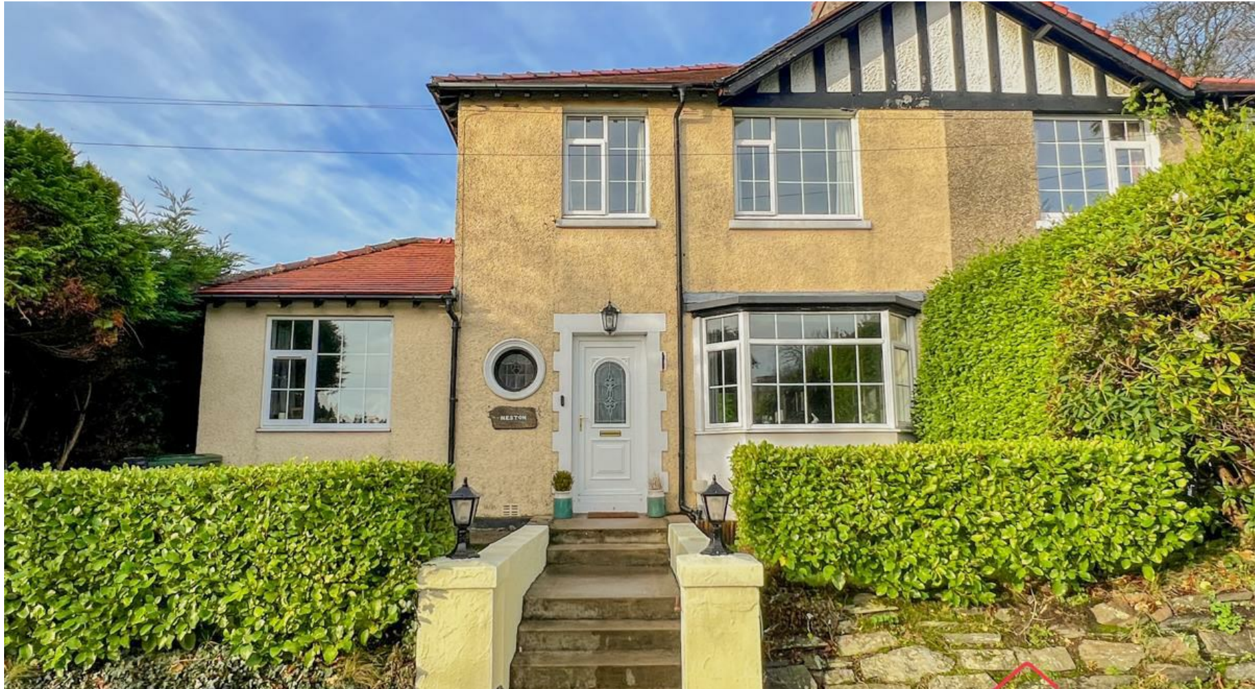
Neston Belmont Road, Douglas, Isle Of Man, IM1 4NR Asking Price £429,950